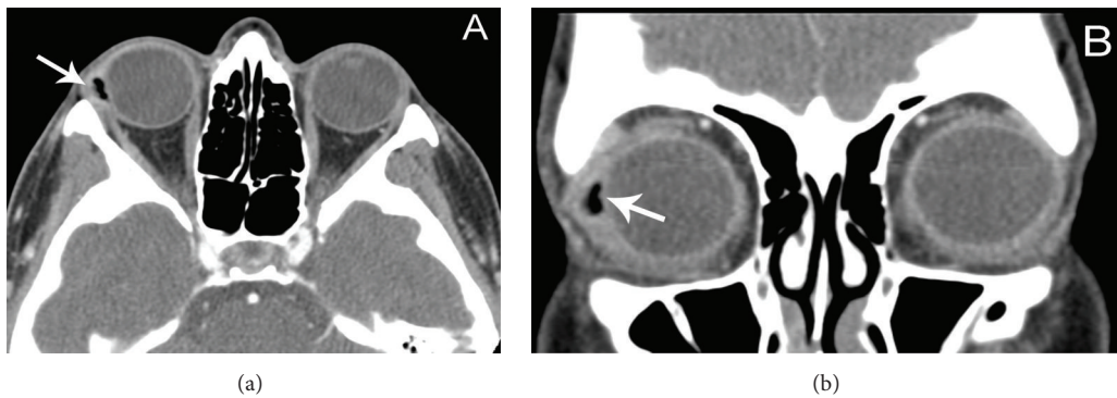
FIGURE 2: (a) Axial CT image identifying a hypoattenuated lesion with slight localized mass effect on the globe with surrounding soft tissue attenuation. Note the irregular, jagged borders of the lesion. (b) Coronal cut shows more definitive surrounding soft tissue attenuation. The hypoattenuation mass, which was confirmed by surgical explantation to be a retained silicone sponge element, was noted to have an attenuation of -284 Hounsfield units.

pressure was 19. She had no APD and normal color vision. She had -1 abduction OD. The right eye exhibited 1 mm of relative exophthalmos. She had no periorbital edema. Temporally and superotemporally, she had a fluctuant, painful, elevated subconjunctival mass (Figures 1(a) and 1(b)). The conjunctiva was scarred and closed temporally. The rest of the ocular exam was normal other than retinal laser scars.