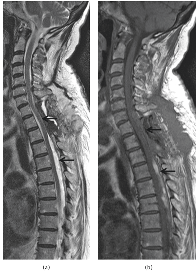
FIGURE 3: Postsurgical MRI scan. Sagittal views: T2 (a) and T1 (b). Resolution of spinal cord compression in the operated segment (D1–D3) upper arrows, with persistence of cord compression at the D4–D7 level (lower arrows).

complete vertebral laminectomy. Postoperatively, paraparesis improved slowly, and the patient was discharged 3 weeks after the last surgical procedure with assisted standing and initiation of walking with aids. Six months after the hospital discharge, the patient's clinical condition had largely improved. She was able to walk alone with the aid of a stick, with mild weakness graded 4/5. A control MRI scan showed D1–D3 and D5–D7 laminectomies without hemorrhagic signs in the spinal cord.