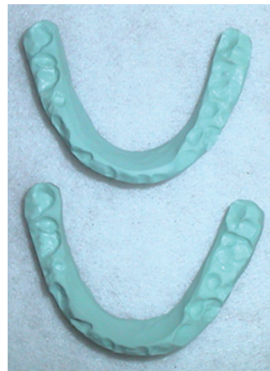
FIGURE 1: Custom-made intraoral appliance used for holistic temporomandibular therapy.

*Data are presented as mean ± SD (range).