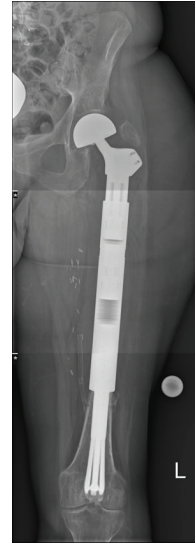
FIGURE 3: Postoperative X-ray of the implanted spreading stem.

2.2. Surgical Technique and Biomechanical Considerations. After resection of the tumour-affected part of the femur, the end of the wide part of the area of the noningrowth region of the prosthesis above the ingrowth rigid fluted stem abuts at the remaining distal femur end cylinder in order to achieve the best possible apposition to the shaft after spreading the distal flat fins. The spreading flat hydroxyapatite coated fins (Figure 2) are fashioned by corundum in order to achieve surface enhancement. The nonspreading part of the prostheses, anchoring in the medullary cavity, is constructed by a primary layer of titan covered by a hydroxyapatite layer. Therefore after the osteotomy, the medullary cavity is reamed in a cylindrical shape of 14, 16, or 18 millimetres (mm) of diameter. The depth of the reamed part should be at least 12 centimetres measured from the osteotomy. After double-checking the length of the final prostheses, the stem is adapted into its final position and an Allen wrench is inserted into the hexagon socket of the grub screw placed on the neck of the prostheses. The screw is then turned to achieve a rearward movement of the expanding rod and its guiding bolt. This