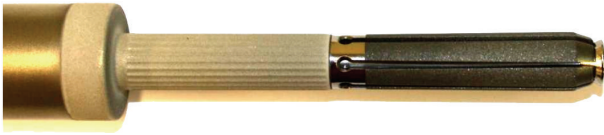
FIGURE 1: Tip of the spreading stem.