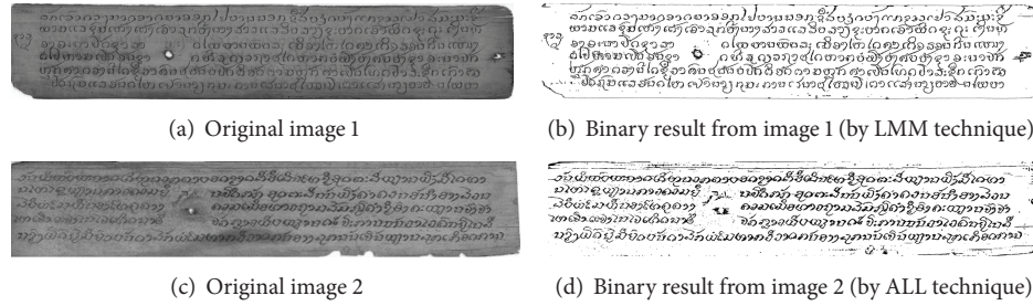
FIGURE 3: Two sample results from an automatic selection of binarization technique.