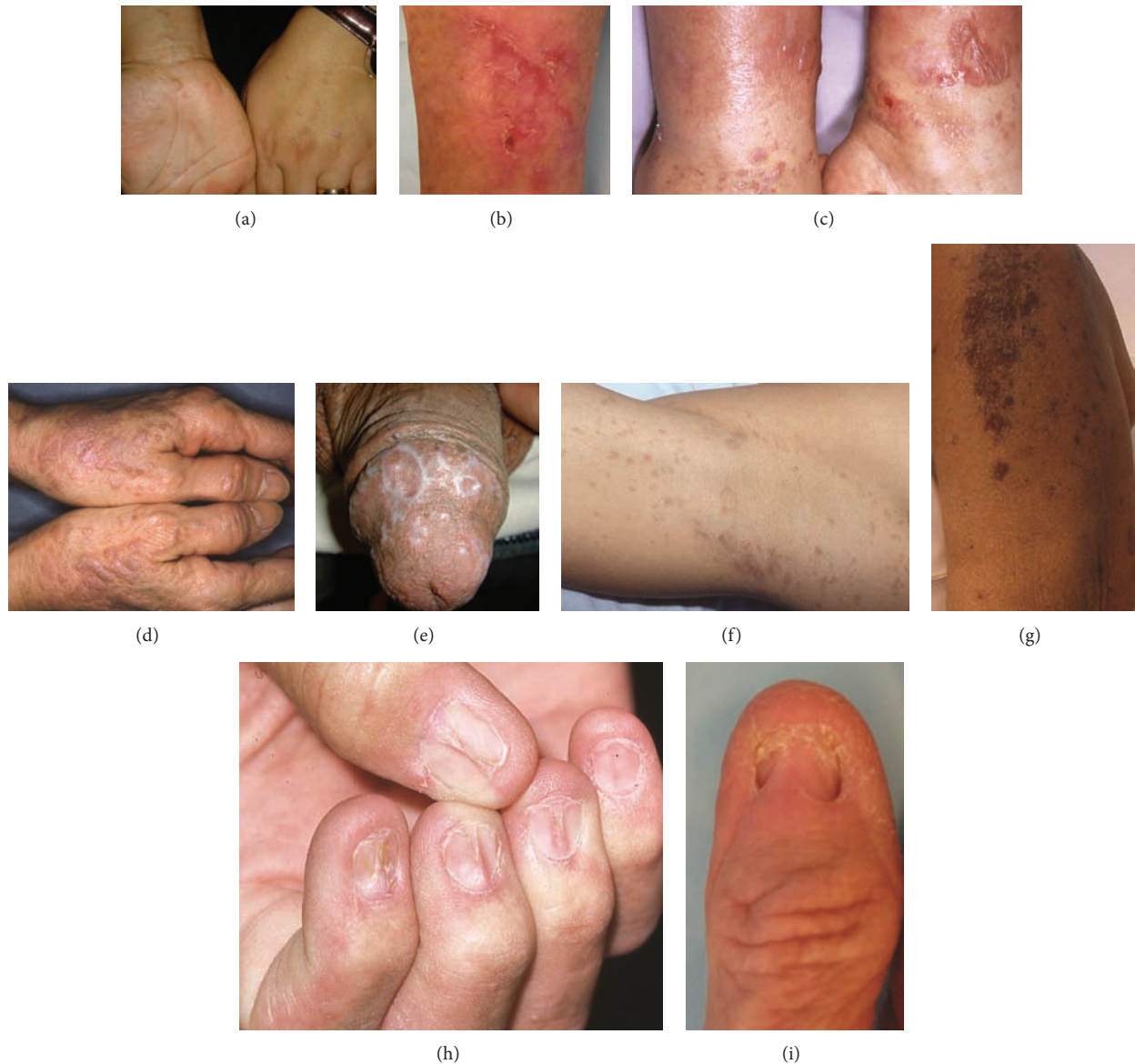
FIGURE 1: (a) Classic CLP: violaceous Papules on the dorsal hand and volar wrist ; (b) hypertrophic CLP: centrally eroded hyperkeratotic plaques involving the lower leg; (c) vesiculobullous CLP: vesicles and bullae on right and left ankles and lower legs ; (d) actinic CLP: hyperpigmented Papules and plaques on the dorsal hands ; (e) annular CLP: reticulated white striae involving the glans penis ; (f) atrophic CLP: hyperpigmented macules and patches on the arm ; (g) zosteriform CLP: linearly oriented confluent violaceous Papules on the arm; (h) nail CLP: longitudinal ridging of the fingernails ; (i) nail CLP: dorsal pterygium of the thumbnail; (a), (b), (e), (g), and (i) are reprinted with permission from [50]. CLP, cutaneous lichen planus.

by the triad of follicular-based spinous Papules on the body, scalp, or both, patchy cicatricial alopecia of the scalp, and noncicatricial alopecia of the axilla and pubic region. It is preferentially more common in females [49].