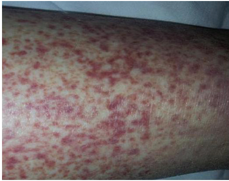
FIGURE 2: Cutaneous leukocytoclastic rash.

long segments in the jejunal loops, multiple lymphadenopathy (the largest was 2 cm), and bilateral chronic sacroiliitis. Since colonoscopy and biopsy results were compatible with Crohn's disease, treatment was started with methyl prednisolone (60 mg/day), ciprofloxacin (1000 mg/day), and metronidazole (1500 mg/day). During followup, both WBC ( 15 \times 10^3/\mu\text{L} ) and CRP (7 mg/dL) decreased, but skin rashes on the lower extremity did not disappear, and the skin biopsy of the patient showed LV. Secondary reasons for LV such as drug use, infection, and additional diseases were investigated, but none of them was found, so LV was considered to be secondary to inflammatory bowel disease (Crohn's disease).