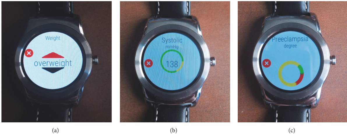
FIGURE 2: (a) Introducing input information with linguistic terms, (b) getting the measurement value from a wireless health device, including the fuzzification and representation of the value with a pie circle chart (green for normal and yellow for severe ), and (c) representation of the degree of preeclampsia with a pie circle chart (green for nonpreeclampsia , yellow for moderate preeclampsia , and red for severe preeclampsia ).