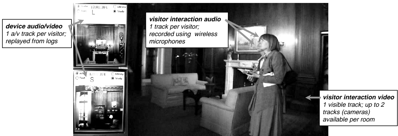
Figure 2. Putting together the composite video for the analyst.

Producing this kind of video requires planning. Resources must be allocated for audiovisual recording and editing equipment. Prototypes must be instrumented to capture necessary information. Finally, the team will likely spend time assisting with the design and execution of the study.