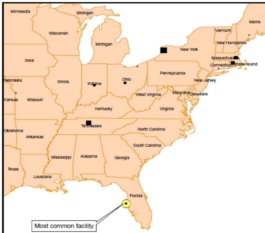
Fig. 2 Most common facility used among the lifestyle mobile Veterans (○) and the ten sharing facilities (■)

healthcare systems [5, 6, 17, 18]. Our study builds upon past work demonstrating greater healthcare mobility among Veterans with PTSD and depression. A recent report about homeless Veterans found that 15 % were healthcare mobile within the VHA system [25]. Future work will need to examine the association between homelessness, mental illness and healthcare mobility.