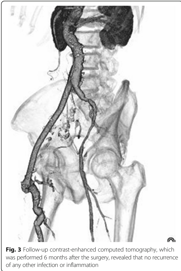
Fig. 3 Follow-up contrast-enhanced computed tomography, which was performed 6 months after the surgery, revealed that no recurrence of any other infection or inflammation

examination of the excised specimens. As a result, the postoperative course was uneventful, and no recurrence of any other infection or inflammation was observed during the 1-year follow-up period.