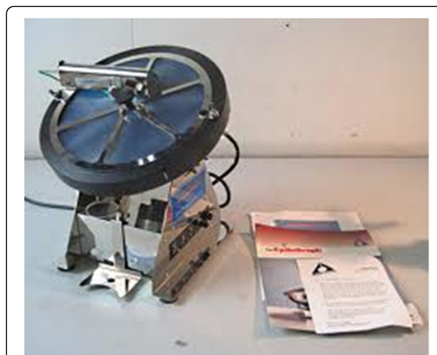
Figure 1 Cyclograph centrifugal chromatography.

Enriched GLA fraction obtained above was directly applied in circular TLC plate placed in a cyclograph.