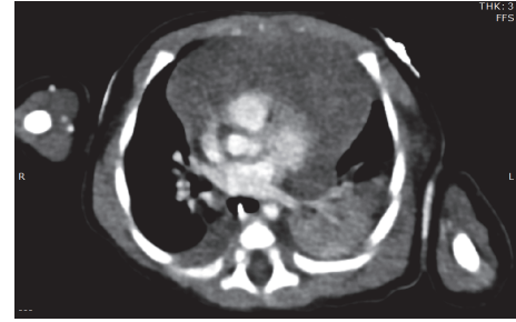
FIGURE 2: CT of chest/abdomen/pelvis demonstrated a homogeneously enhancing anterior mediastinal mass which maintained thymic contour, with mass effect upon the vessels and airway.

Despite resolution of the coagulopathy, the anterior mediastinal mass remained. The differential diagnosis included venous or lymphatic malformations, thymic enlargement, or rarer tumors. Therefore, further diagnostic imaging of the anterior mediastinal mass was pursued. A chest ultrasound revealed a solid mass without cystic components, making an infantile lymphangioma unlikely. A CT of chest/abdomen/pelvis (Figure 2) demonstrated a homogeneously enhancing anterior mediastinal mass which maintained thymic contour, with mass effect upon the vessels and airway. The homogeneity of the mass was thought to be inconsistent with the typical appearance of a germ cell tumor. While the infant's coagulopathy and borderline thrombocytopenia initially raised concern for Kasabach-Merritt phenomenon