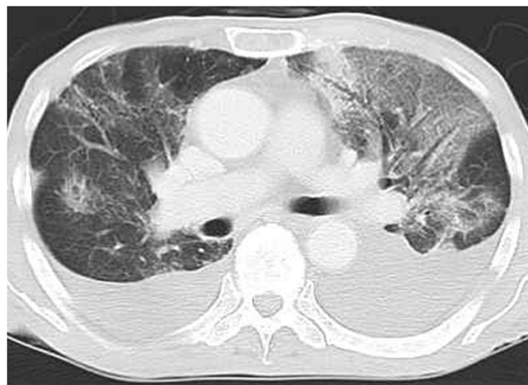
Figure 1 Chest computed tomography on admission. Bilateral pleural effusion and diffuse ground-glass opacity was apparent, and thickened septal lines and diffuse reticular opacity were evident in both lungs.

Pulmonary eosinophilic infiltrates are a heterogeneous group of disorders characterized by the presence of eosinophils in the lungs, as detected by BAL or tissue biopsy, with or without blood eosinophilia. Pulmonary infiltrates, characterized by foci of air-space consolidation and focal ground-glass opacity, can be seen in pulmonary eosinophilia of all causes [11]. The findings from CT and careful clinical evaluation must correspond in order