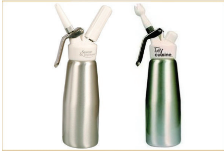
FIGURE 1: Whipped cream siphon implicated.