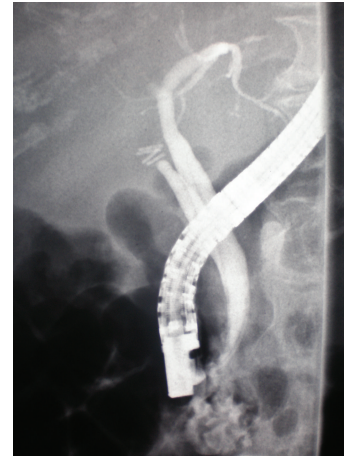
FIGURE 1: During the repeat ERCP a stent was placed in the terminal bile duct. Intrahepatic biliary ducts appear significantly narrowed.

Clinical manifestations of liver amyloidosis are not frequent and usually are not mentioned. Hepatomegaly is one of the leading signs in these cases [2], often causing right upper quadrant fullness and discomfort, as in our case. Moreover symptoms associated with food intake, such as early satiety, nausea, dyspepsia, and weight loss, are also noted [3]. Other signs and symptoms are relatively uncommon and mild. Ascites can be found in some patients [4], but it is usually present in patients with systemic amyloidosis (e.g., in patients with congestive heart failure or nephrotic