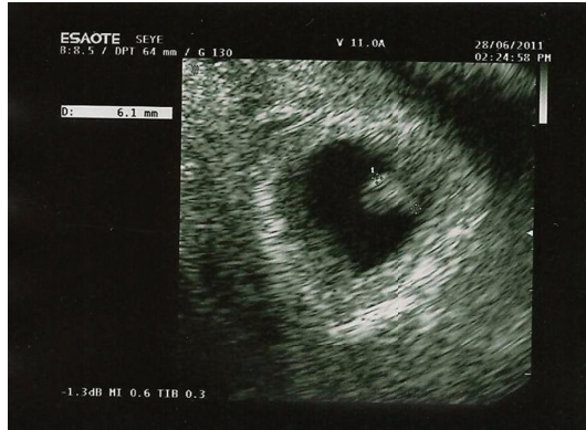
FIGURE 1: Transvaginal ultrasound of uterus showing a gestational sac of approximately 7 weeks.