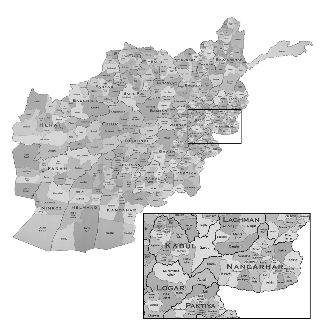
Figure 1. Nangarhar Province in Afghanistan (adapted from University of Texas Libraries 2012).