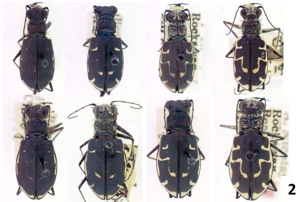
Figure 2. Adult specimens of Cicindela hirticollis Say collected at Rockaway Beach on Long Island between 1909 and 1932, showing variability in elytral color pattern ranging from the form described as C. h. hirticollis Say (right) to the form described as C. h. rhodensis Calder (left). Specimens in top row are males; specimens in bottom row are females.

deliberately chose to survey stretches of the larger beaches that showed the fewest signs of human disturbance.