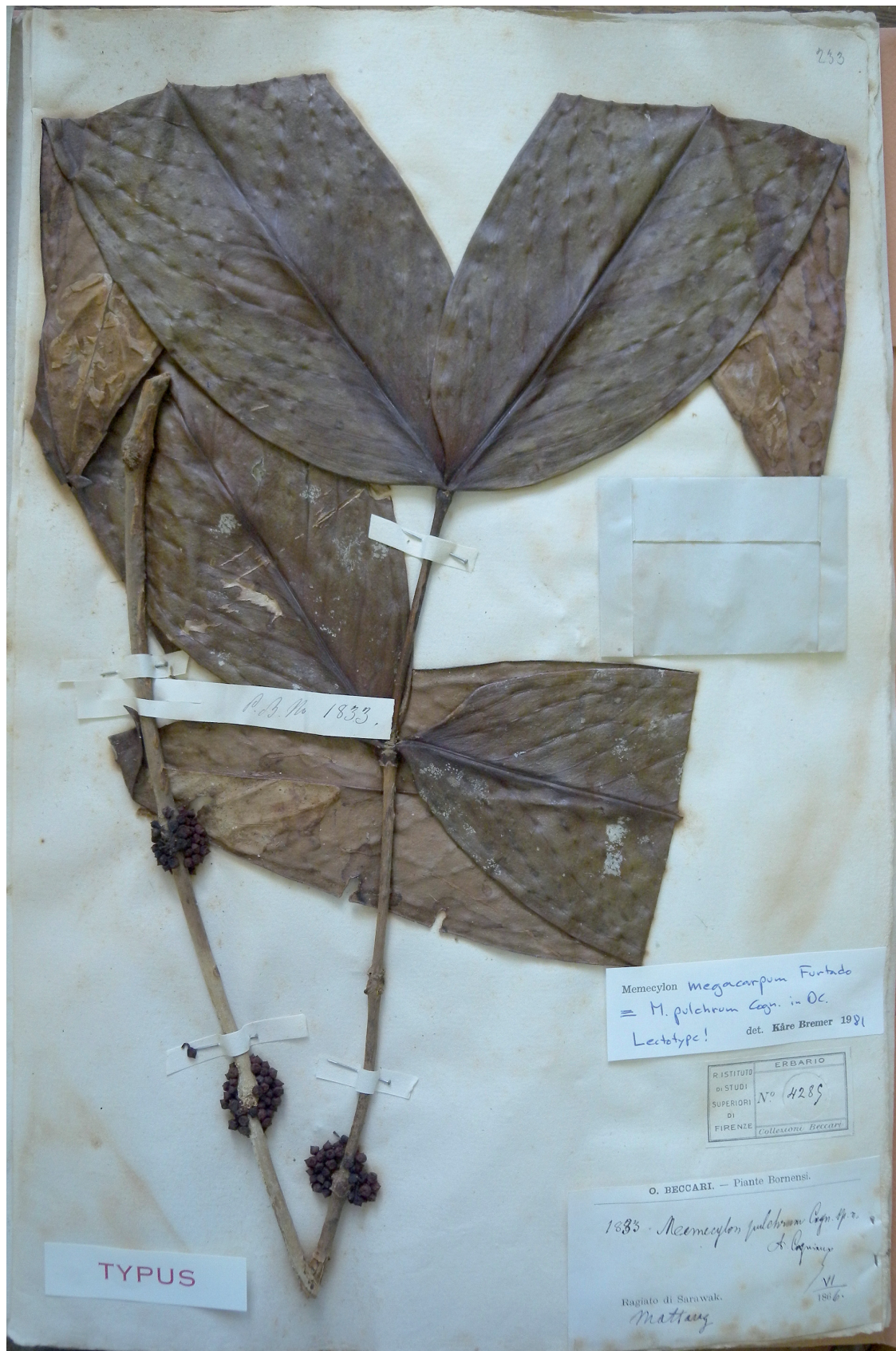
Fig. 1. Image of a syntype of Memecylon megacarpum Furtado [Beccari 1833 (FI)].