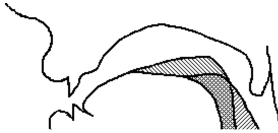
Figure 1: Retraction, indicated as shaded areas, in comparison to neutral tongue position. The upper displacement is a velarization gesture, the lower pharyngealization.

The legitimacy of combining the distinct secondary articulations pharyngealization and velarization as one property is further confirmed by the fact that they are described as resulting in the same acoustic consequence, namely a lowering effect on the third formant (Brosnahan & Malmberg 1970; Stevens 1998). Both velarization and pharyngealization occur with a flattening of the tongue body, which is included here as a characteristic of ‘retraction’.