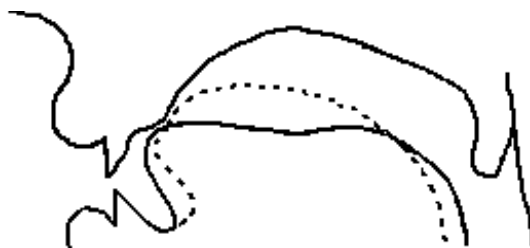
Figure 2: Russian retroflex fricative (solid line) and palatalized postalveolar fricative (dashed line)

The incompatibility of gestures and the change in primary place is exemplified with the Russian fricatives in the postalveolar region. Figure 2 is based on x-ray tracings of the Russian retroflex fricative (solid line) and its palatalized counterpart (dashed line) (both based on Bolla 1981: 159). As illustrated in Hamann (2002), the Russian postalveolar fricative is a retroflex which satisfies the property of retraction. 5