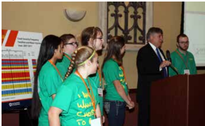
A group of students from Saydel High School was able to join attendees and discuss the program they have started to keep young drivers safe.

To continue this multidisciplinary approach, the Iowa DOT hosted members of the safety community at a workshop Jan. 23 to begin the updating of the state's new Strategic Highway Safety Plan (SHSP), modeled after the original CHSP.