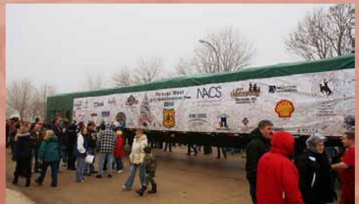
U.S. Capitol Christmas Tree making a stop in Britt.