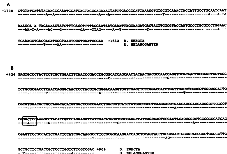
Fig 3. Comparison of the \alpha -amylase coding and intergenic regions of D erecta with the homologous sequences of the D melanogaster strain, Oregon R (Boer and Hickey, 1986). (A) Sequence from the intergenic region (see Fig 2 for location of this region). (B) Sequence from the coding region (see Fig 2). Only the nucleotides that differ from D erecta are shown for D melanogaster . The mutated Bam H1 site (Payant et al , 1988; and see discussion in text) is boxed. Sequences are numbered relative to the translation initiation site. Although sequence data were obtained for both copies of D erecta , only a single coding sequence is shown for this species; this is because both gene copies had identical sequences for this portion of the coding region (see discussion in text).