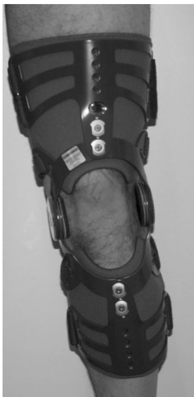
Fig. 3 An image of a left knee shows the MOS Genu® knee brace.

bracing group was similar ( p = 0.3 ) with ( 7.0^\circ ; SD, 3.6^\circ ) and without the brace ( 6.7^\circ ; SD, 3.2^\circ ).