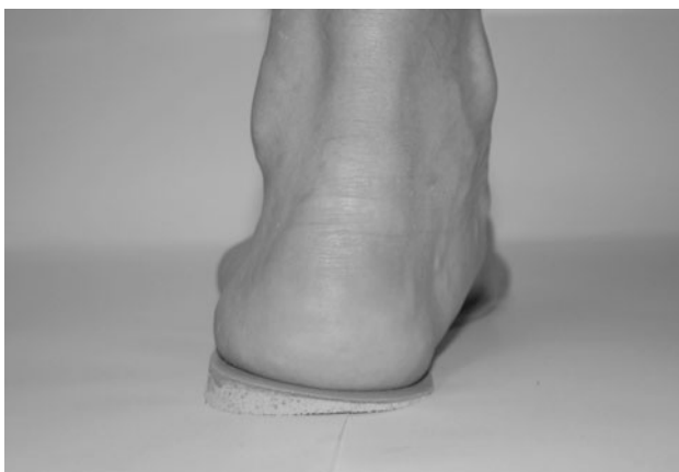
Fig. 2 An image of a left foot shows the leather sole and a laterally wedged cork elevation of 10 mm (6° wedge).

effect size, 0.03) and WOMAC function scores (mean, 0.15; 95% CI, -7.95, 7.65, effect size, 0.008). Compared with baseline, the pain severity and WOMAC function scores improved in both groups (Table 2). The intention-to-treat and per-protocol analyses showed no differences in percentages of responders (improvement of \geq 20\% compared with the baseline scores for VAS pain and WOMAC function) between the insole and the brace groups (13% versus 20% and 14% versus 18%, respectively).