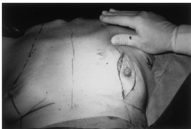
FIG. 2. The inverted drip incision, starting with a round edge just above the nipple down to 1 to 2 cm above the inframammary fold, with a sharp edge.

incision, but a separate incision may be needed if there is inadequate access to the axillary vein. After mastectomy, a subpectoral silicone implant (Cristalline Paragel; TM Laboratoire Eurosilicone, Apt, France) ranging from 150 to 600 mL is inserted through the greater pectoral muscle. Great care is taken to dissect sufficiently far down under the origin of the rectus abdominis muscle and laterally under the serratus muscles, and sometimes even part of the pectoralis minor. Two suction drains are placed: one beneath the pectoral muscle and the other under the skin layer. The skin is closed in layers, without correcting the dog ears. Patients are scheduled for a 5-day stay. The suction drains are removed after production of \leq 20 mL of drain fluid on two consecutive days. The operation is performed under prophylactic antibiotic and subcutaneous anticoagulant administration. Nipple reconstruction is offered after 6 months.