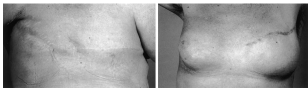
FIG. 1. Photographs of two patients illustrating the surgical history of mastectomy for breast cancer. Left: the right side shows the Halsted incision, and the left side shows a modified mastectomy. Right: the right side shows a lumpectomy and radiotherapy for breast-saving therapy, and the left side shows an immediate reconstruction with a subpectoral prosthesis after mastectomy.

Whether the skin-sparing incision is safe has not yet been investigated in a randomized phase III study; published data are mainly based on personal experience. Carlson et al. 17 compared their series of 188 patients undergoing skin-sparing mastectomy with a historical control group of 327 patients with mastectomy alone and concluded that the local recurrence rate was similar in both groups (4.8% vs. 9.5%, respectively, after a median follow-up of 41 months). This conclusion was confirmed