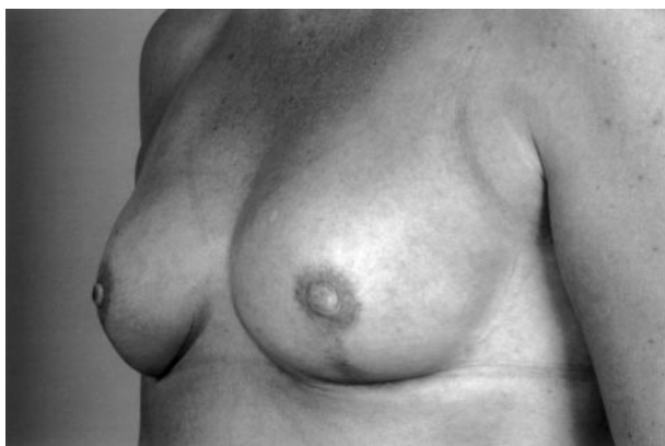
FIG. 4. Bilateral prophylactic mastectomy with inverted drip incision and immediate reconstruction and delayed nipple reconstruction, as performed in our clinic.

In summary, our experience is that MIDIIR is a safe and quick procedure. MIDIIR in our hands had an acceptable complication rate and an acceptable rate of definitive loss of prostheses. The envelope technique allows placement of prostheses of up to 600 mL without the use of a tissue expander. With this technique, another reconstruction can be made after removal of the silicone prosthesis. Regarding limitations, the MIDIIR is not the method of choice for obese patients and those with large breasts; to avoid a bad cosmetic result in these cases, another reconstructive technique (such as transverse rectus abdominis myocutaneous or latissimus dorsi flaps) is recommended. Additional studies are required to determine the long-term cosmetic results of MIDIIR, especially in women with increasing weight and patients with previous radiotherapy.