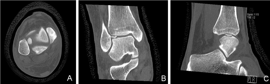
Axial (A), coronal (B) and sagittal (C) reconstructions of the computed tomography scan clearly showing the inverted fragment.