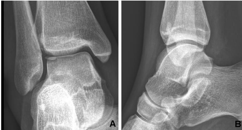
Figure 1. Initial conventional radiographs showing a wafer shaped osteochondral lesion at the anterolateral portion of the talar dome

Anteroposterior (A) and lateral (B) radiographic views of the ankle showing a loose fragment anterolaterally.