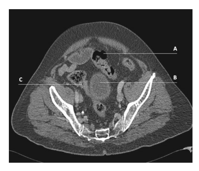
Fig. 1 Preoperative CT image without evident signs of free fluid or generalized peritonitis of a patient who appeared to have Hinchey 3 perforated diverticulitis during surgery. A free air; B bladder; C colonic diverticulum

with Hinchey 3 diverticulitis are understaged (as Hinchey 1 or 2) by retrospective assessment of the CT scan. The main reason for this discrepancy was the relatively small amount of free intra-abdominal pus found during surgery. This can easily be missed on an emergency CT scan (Fig. 1). Another reason for the relatively high number of misclassifications of Hinchey 3 perforated diverticulitis by preoperative CT scanning could be rupture of a diverticular abscess, in which Hinchey 2 perforated diverticulitis found on the CT scan has proceeded toward Hinchey 3 at the time of surgery [19]. It is therefore possible that future patients who undergo CT scanning are classified as Hinchey 1 or 2 perforated diverticulitis and are treated according to these CT findings (that is conservatively), are in reality Hinchey 3 patients (n = 16/41; 39 % of Hinchey 1 and 2 cases; Table 3), and should have been treated surgically. It seems that only Hinchey 4 perforated diverticulitis is excellently staged by CT scanning. The conclusion after the radiologists' report will always be that emergency surgery is indicated in these patients. Due to the low sensitivity of CT scanning in Hinchey 3 patients, the predictive value of CT for conservative treatment is only 61 %.