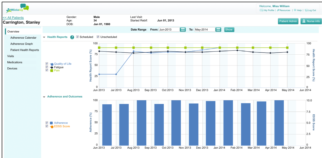
Fig. 1 MSdialog graphs representing sample results for selected patient-reported outcomes ( line chart in upper half of figure ) and treatment adherence ( bar chart in lower half of figure ) in the healthcare professional view. Names and personal details in figure are

fictitious and for illustrative purposes only. Displaying the EDSS score in the MSdialog graphs is optional and the EDSS score data are not included in the figure