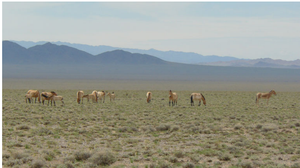
Fig. 3 The risk of cross-infection between the sympatric equids. Przewalski's horse herd with one single Asiatic wild ass on the right

Przewalski's horse, socially structured in small, stable harem groups or in bachelor groups, have far smaller home ranges and therefore have a significantly lower exposure to contaminated patches (Fig. 2). Mongolian domestic horses stay in groups of 10–50 horses. Herders move them from one green pasture to another, without paying attention to which horses were grazing and defecating there before. Furthermore, these domestic equids could differ immunologically with respect to parasites from their wild counterparts, are handled occasionally by herders, and may suffer more from stress (Elias et al. 2002; Sharkhuu et al. 2000).