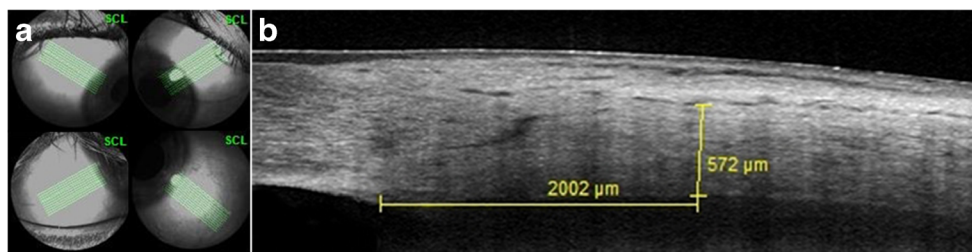
Fig. 1 Anterior segment spectral domain optical coherence tomography scans. The photographs illustrate the scan acquisition ( a ) and measurement of the anterior scleral thickness 2 mm posterior to the scleral spur ( b ). In each quadrant, 21 high-resolution B-scans taken approximately perpendicular to the tangent to the limbus were recorded,

the inferonasal quadrant, 511 (80) \mu\text{m} in the inferotemporal quadrant, 475 (81) \mu\text{m} in the superotemporal, and 463 (64) \mu\text{m} in the superonasal quadrant.