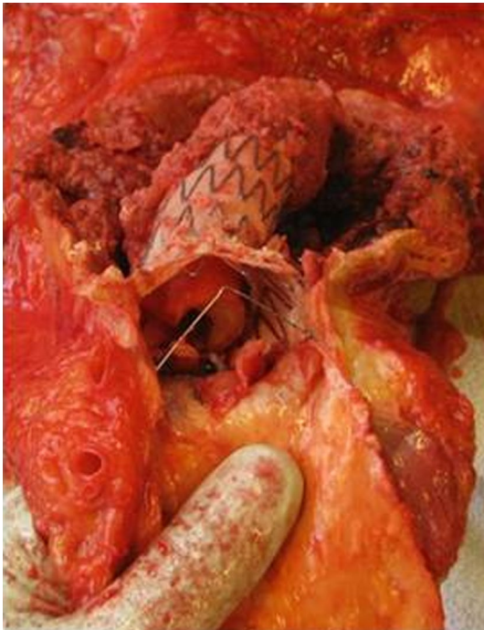
Fig. 3 Cranial view, during autopsy, of the abdominal aorta with the endovascular aneurysm repair (EVAR) stent-graft. The lumen of the celiac trunk and superior mesenteric artery are visible. Around the EVAR the aneurysmatic plaque inside the dilated vascular wall is still in situ, the material was PCR positive for C. burnetii . A fistula from the abdominal aortic aneurysm (AAA) to the psoas abscess was present (not visible on picture). Inside the EVAR an intra-prosthetic deposition of amorphous material is visible

patient already reported general malaise for years, chronic chest pain and left flank pain ever since the EVAR procedure. Furthermore, he already had an elevated CRP whilst consulting the cardiologist, pulmonologist and rheumatologist in the years before presentation, who related this to his active RA and intercurrent problems. Our patient lived in an area in the Netherlands with the highest incidence of Q fever during the large Q fever outbreak from 2007 to 2010 [15, 16], and inhalation of contaminated aerosols was probably the route of initial infection [17]. In Q fever endemic areas or in the years after outbreaks, physicians should stay alert on signs and symptoms suggestive for chronic Q fever, especially in case of risk factors, also in the absence of a known acute Q fever episode. Well-known risk factors for developing chronic Q fever include vascular grafts and aneurysms, cardiac valve prosthesis or valvulopathy, and immunosuppression [18]. Despite the fact that EVAR specimens appeared to be PCR positive for C. burnetii , the EVAR could not be revised in this case. The main reason for the decision to abstain from surgical intervention was the already expanded infection, and the patients' deteriorating physical condition. However, in case of a chronic Q fever infection of a vascular prosthesis, surgical interventions can