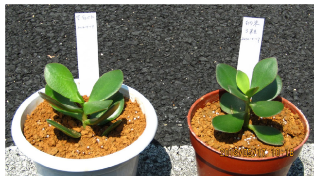
Fig. 3 Jade plant ( Crassula argentea ) treated with nanomaterial and the growth of new leaves were promoted (yellow pot) compared to the control (white pot) (10 days after treatment)