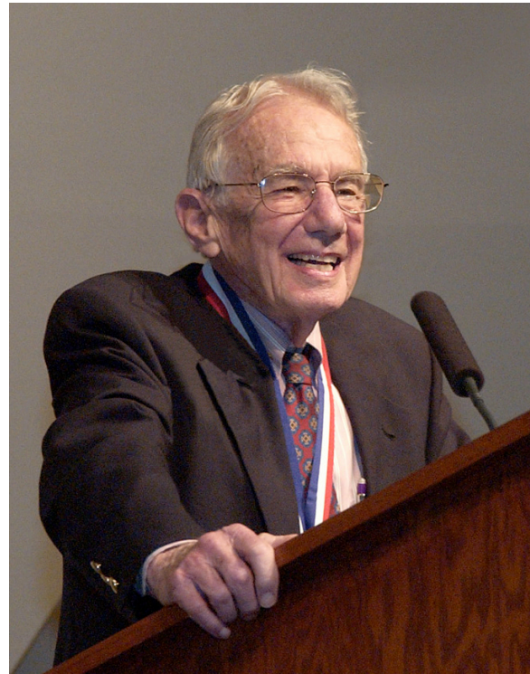
Figure 1. Arthur H Rosenfeld.

Dr Rosenfeld (figure 1) made a transition from particle physics to studying energy efficiency at the time of the first oil embargo (Rosenfeld 1999). Over the past 35 years he has been at the forefront of efforts to improve the efficiency of energy use around the world and has devoted special care to making the results of complex energy analysis understandable to a