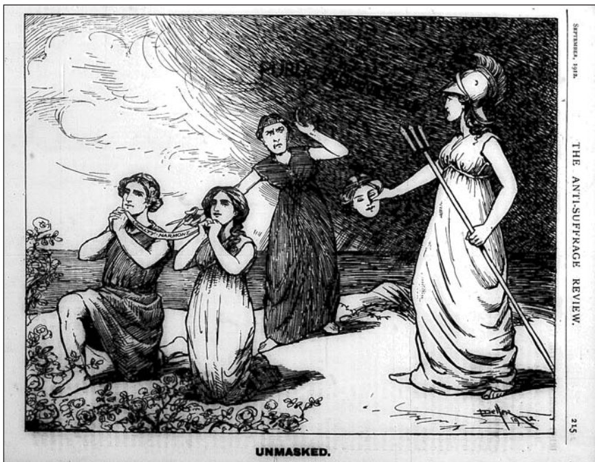
Figure 2. “Unmasked!” Anti-Suffrage Review , September 1912.

masked” is a woman, but in this case she wears a headband marked “Feminist” (Figure 2). 20 In her right hand, she holds a pair of scissors, poised to cut a ribbon marked “loyalty–harmony.” The ribbon is held jointly in the hands of a male and a female figure, both kneeling with peaceful facial expressions. A fourth figure, a helmeted woman, holds a trident and a mask. The single word caption suggests that the “feminist” has just been “unmasked.”