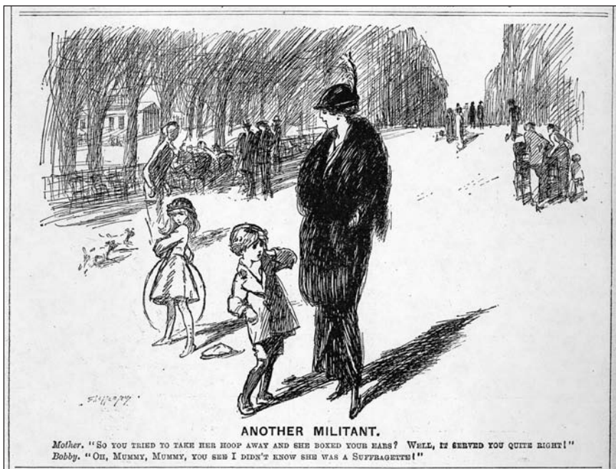
Figure 6. "Another Militant," Punch , 19 March 1913.

For students, the ambivalence of these cartoons presents distinct challenges, but also stimulates particularly suggestive interpretations of women's identities and the gendering of power. The best evidence of the complexity of these interpretations comes from a multiple-choice test administered in a European survey course. When asked about "The Suspect," 15 percent saw it as pro-suffrage, twice as many (30 percent) saw it as anti-suffrage, and about one-half (55 percent) identified it (correctly) as a commentary on the suffrage campaign itself. The span of responses to "Another Militant" was even broader, as 18 percent read the cartoon as pro-suffrage and 26 percent read it as anti-suffrage. While such varied results (certainly less than a passing grade!) might ordinarily alarm an instructor, this range of responses becomes a "teachable moment" for exploring the complex relationship between meaning, symbols, and content.