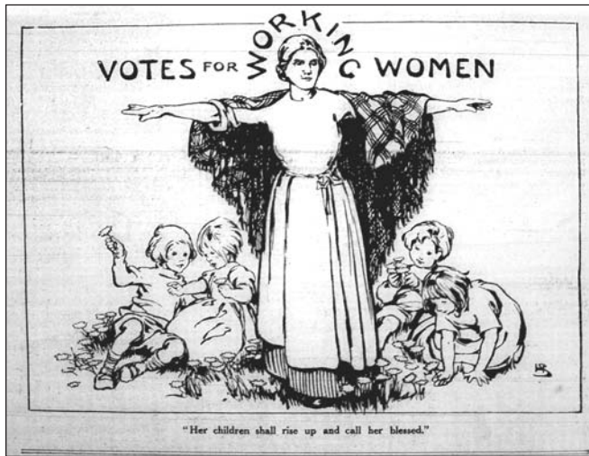
Figure 3. "Votes for Working Women!" The Suffragette , 7 January 1913.