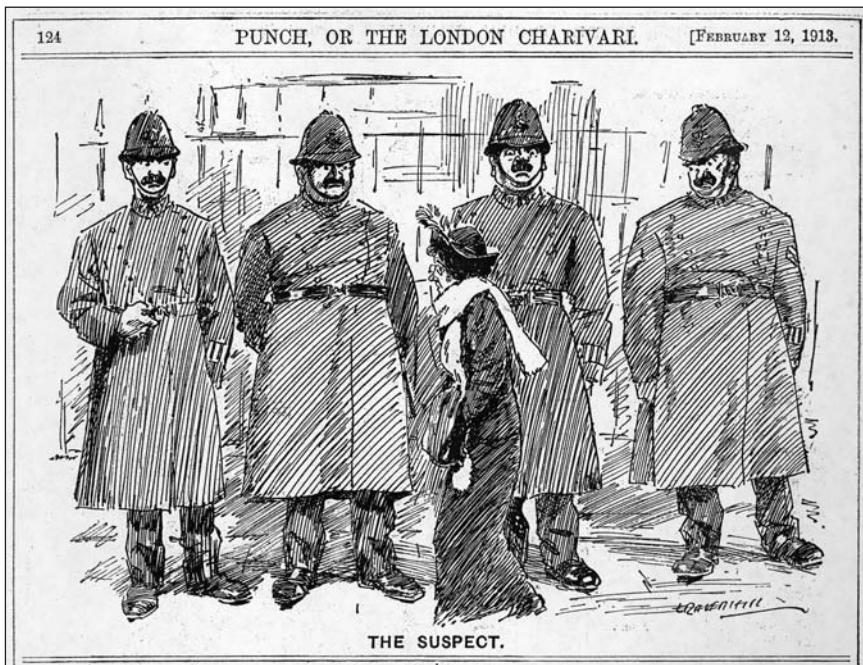
Figure 5. "The Suspect," Punch , 12 February 1913.

In the last of these cartoons, "Another Militant," a well-dressed woman stands in a park, with an array of men, women, and children strolling in the background (Figure 6). 32 Two children, also well-dressed, stand next to her: a girl grasping a hoop and a boy holding his hand to his face. The dialogue and caption, working together, indicate the actions and sentiments of the protagonists. Mother: "So you tried to take her hoop away and she boxed your ears? Well, it served you quite right!" Bobby: "Oh, Mummy, Mummy, you see I didn't know she was a Suffragette!" This cartoon pokes fun at the gender reversals associated with the suffrage campaign. The girl's assertiveness and the boy's humiliation are explained by the claim that this girl "was a suffragette." While many opponents of suffrage seized on images of "unfeminine" militancy to discredit the movement, "Another Militant" can also be read as a more positive commentary on the changing attitudes and behaviors of girls and women. When the mother says, "it served you quite right!" she provides a kind of affirmation for her daughter's stance. Terms like "suffragette" thus had multiple potential meanings in this context, and this cartoon plays with these conflicting perceptions to provoke humor as well as social commentary.