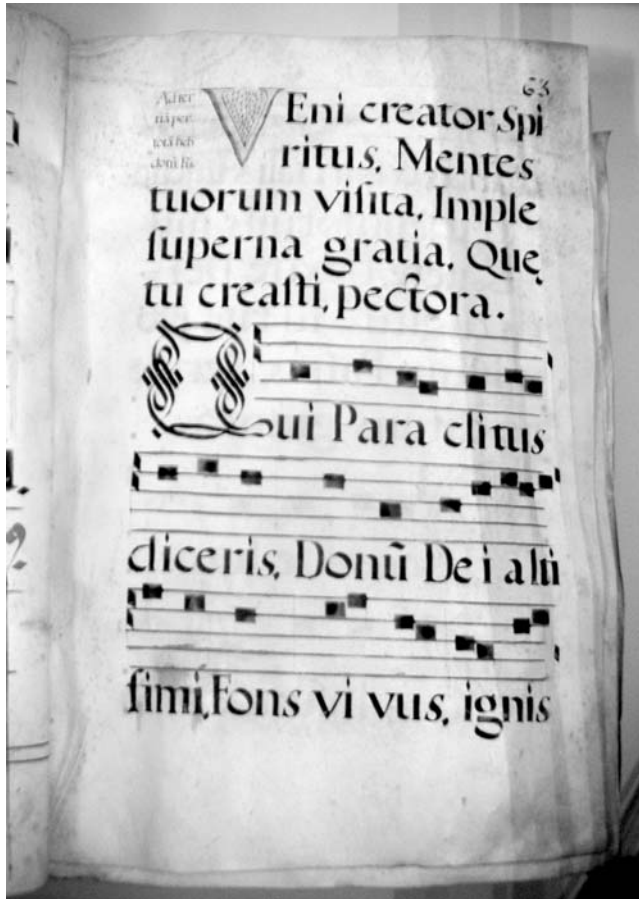
Figure 2. Veni Creator Spiritus, Carmel Mission Ms. 2, “Antiphony,” Ms. 308.1955.46.139, fol. 4.

of the Te Deum , we find it incorporated into the festive pageantry at the inauguration of Governor Pablo Vicente de Solá at Monterey in 1815. 13 In short, Serra’s selection of core material was part of a broad and long-lasting tradition, not a personalized and idiosyncratic one. 14