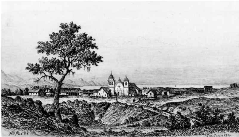
Figure 1. Carmel Mission (“View of San Carlos Borromeo Mission”) (1883), by Henry Chapman Ford. Bancroft Library, BANC PIC 1963.002:0917:18-ffAL. Photo courtesy of the Bancroft Library, University of California, Berkeley. Pictures found in the Online Archive of California (OAC). http://content.cdlib.org/ark:/13030/tf5j49p2cz/?brand=oac

and impress the Native Americans who would have been watching the peculiar assemblage that had ventured onto their shores. In his letter of 12 June Serra delineates in minute detail each of the events: