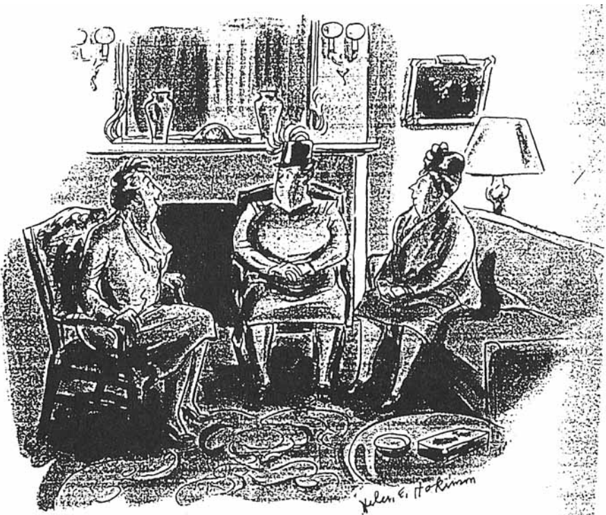
"I know what! Let's have an Old-Fashioned before we start talking French."