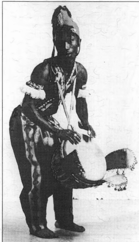
PAC-bound: West Africa's Ballet National du Senegal. See page 2.