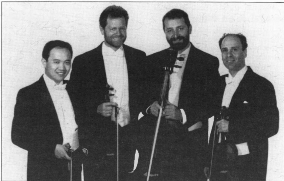
The award-winning Alexander String Quartet will perform in Harman Hall.

To register, call the San Luis Obispo Fire Department at 781-7380. □