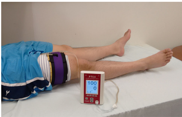
Fig. 1 Photograph of a volunteer with dual-purpose two-layer cuff and matching limb protection sleeve applied to limb. Cuff is pneumatically connected to tourniquet instrument that contains LOP calculation sensors and software

The patient was instructed to inform the experimenter if the cuff pressure became uncomfortable and measurements were discontinued if a patient requested the cuff to be deflated prior to completion of the measurement.