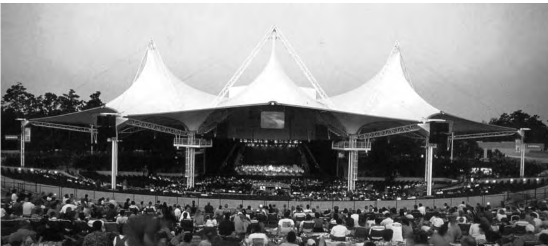
Figure 3. Performing Arts Pavilion, Woodlands, Texas (from Gause, J., ed. "Great Planned Communities". Washington: ULI, 2002).