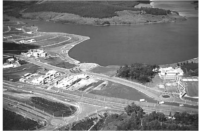
Figure 4. Aerial view of the commercial center in Lagoa dos Ingleses, Brazil.

Tres Cantos, located at the edge of the Madrid Metropolitan area, is Spain's only new town project. It began in the late 1970's as a means to accommodate urban growth in the