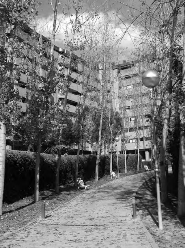
Figure 6. Multi-story Apartments in Tres Cantos, Spain.

associated a variety of services. The industrial parks are located in three parts of the city. And there is a big park in the centre of the city. The city is connected to metropolitan Madrid by public transport, train and coach, and a large divided main highway.