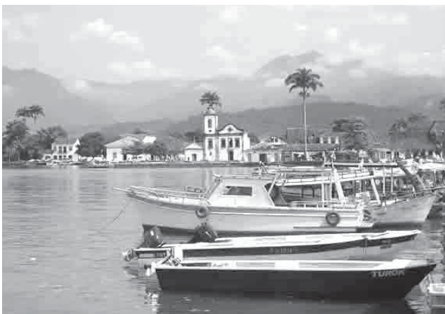
Figure 5. The historic colonial town of Paraty, on the coast south of Rio.

Brazil was my first real experience outside the United States, and almost everyone told me this experience would be life changing. I have to agree that it was just that, even though the difference came about through a different means than I expected. Together, my academic and personal experiences were very educational. I was able to step from a perspective I have always had into another where concepts and ideals I had been taught as import took a back seat to basic necessity such as health and safety. Rio knows no bounds, it is an amazing city in a country where culture and character is everywhere. The people I met and the memories I have are irreplaceable