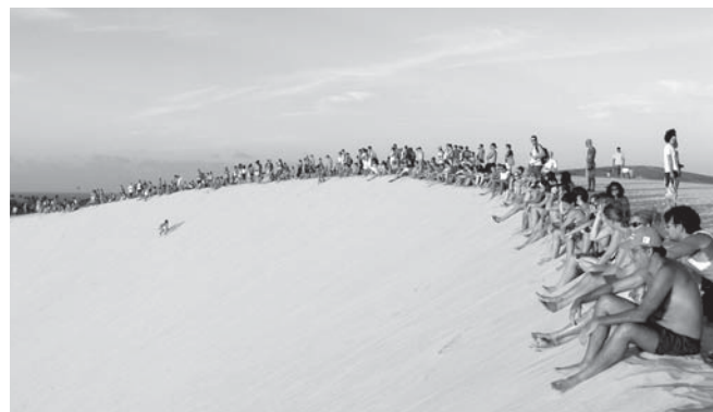
Figure 8. Sunset in Jericoacoara Ceará (Northeast Brazil), overlooking the Atlantic from the top of the sand dunes.