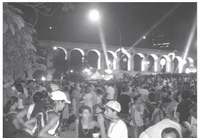
Figure 8. Partying on a Saturday night at Lapa, Rio de Janeiro. A revitalized area with numerous bars, art galleries, and night clubs that holds several public events in the year.