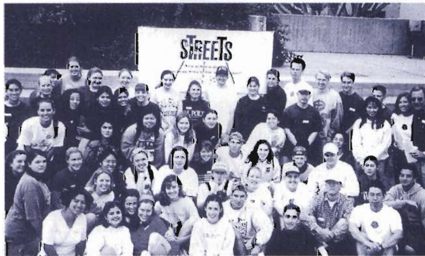
"Into the Streets": Nearly 100 students get ready for a day of service with a motto of "Try it for a day / You'll love it for a lifetime."

To acknowledge the importance of community service, Cal Poly gives annual president's awards to students, faculty, and community agency partners who help integrate education and community work. Students who