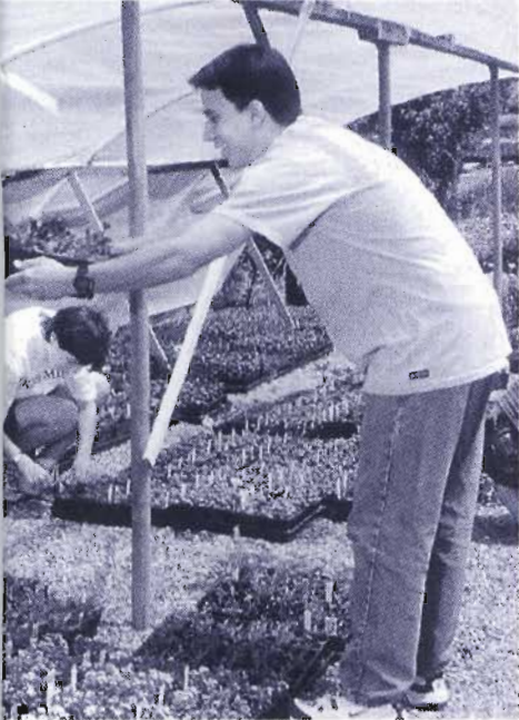
achievement by Renew America, a national nonprofit organization that seeks out innovative environmental programs.