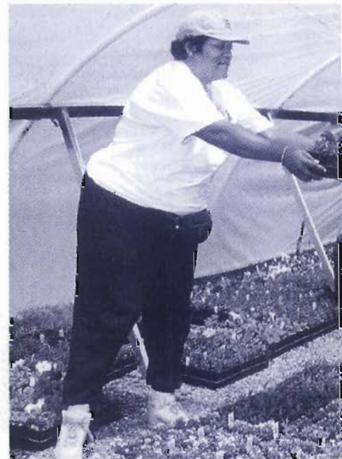
Clients and students work together in a greenhouse at San Luis Obispo's Growing Grounds. The nursery was awarded a certificate of environmental

The center is the university's link between theory and practice in the field. Its staff is dedicated to helping Cal Poly students in all majors find meaningful service experiences through ongoing, student-directed projects and events, club-sponsored efforts, and