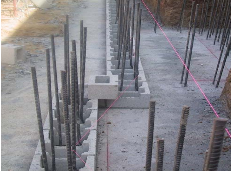
Figure 6: CMU Reinforcement Placement