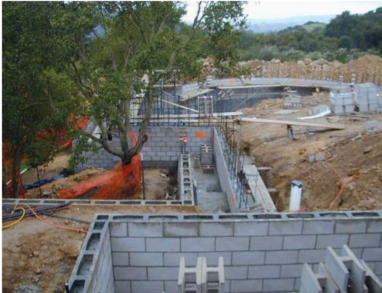
Figure 7: CMU wall showing grouting