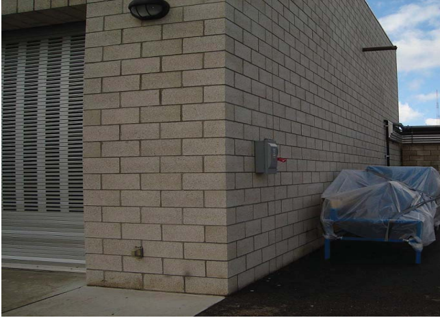
Figure 1: CMU wall elevation