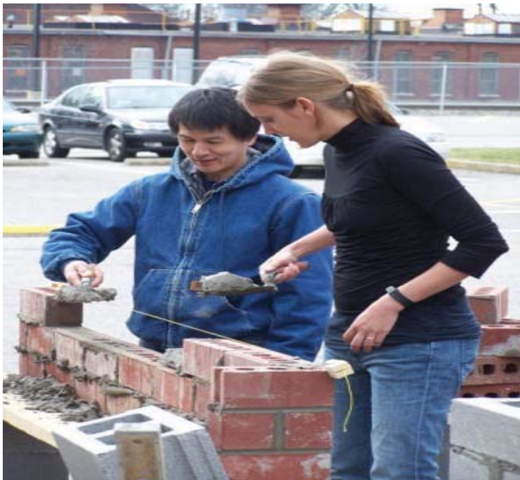
Figure 5: Construction of brick wall 1