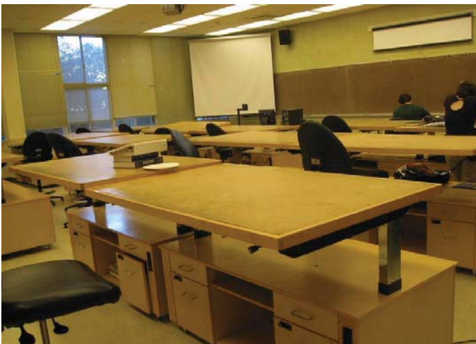
Figure 3: Typical smart room used for laboratory design courses