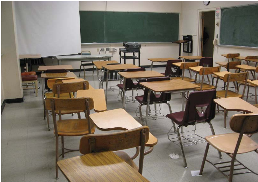
Figure 2: Typical smart room used for element design courses