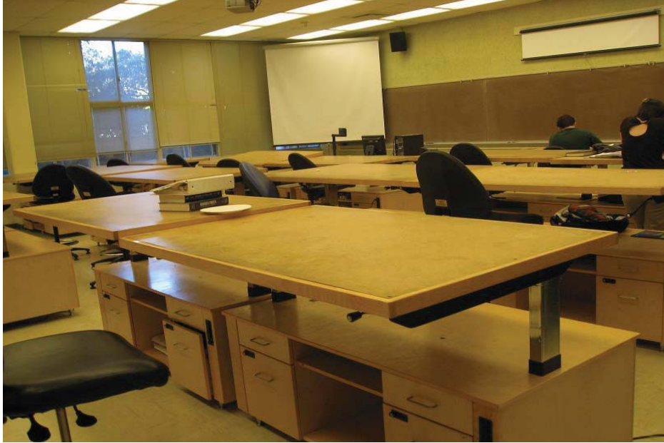
Figure 3: Typical smart room used for laboratory design courses