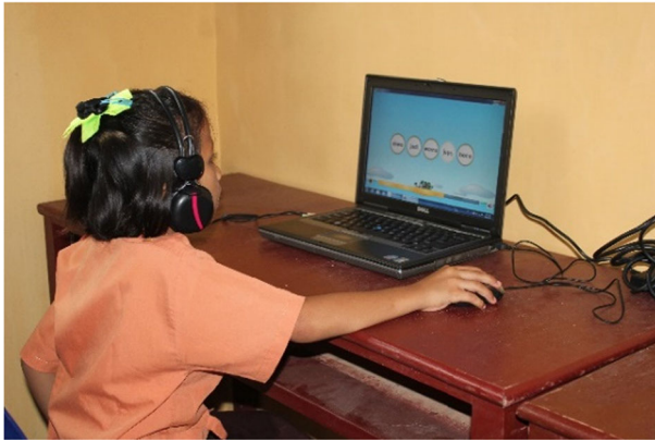
Fig. 1 A child playing GraphoGame SI

grade elementary school reading textbooks. Using International Phonetic Alphabet (IPA) transcriptions of every word included in the database, we determined the (relative) frequencies of the grapheme-phoneme correspondences and syllables within the words. This information was used to determine the order in which the items were introduced in the game. All auditory stimuli and instructions were recorded from one male and one female native speaker of Standard Indonesian. All items were subsequently evaluated by other native speakers with respect to their prototypicality, and only the most prototypical items were used in the game. This resulted in one to three different spoken realizations per target.