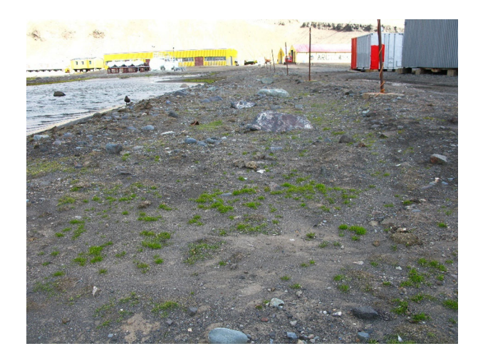
Fig. 2 Poa annua in the vicinity of Arctowski Station

assumed seed rain and our interpretation of results might have been biased. The selected scheme potentially allowed to minimize the interference of seed rain of plants growing in the vicinity. At each sampling point we collected 100 cm<sup>3</sup> of soil from the 0–5 cm layer. We collected 80 soil samples amounting to 8 liters and 0.157 m<sup>2</sup> soil surface area. The collected samples were air dried at room temperature at the Station and transported to our laboratory in Poland at 4 °C.