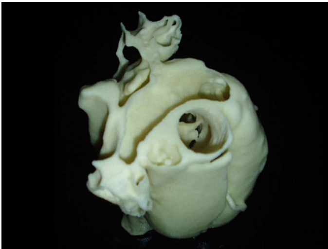
3-D printed model of the internal valves of a patient's heart. The data was extracted from a MRI scan.

Even though the 3-D printed model may not change the way in which traditional surgery is conducted, it serves as an additional aid in the operating room and can improve surgical success. “Stereolithography has been shown to be a useful tool in maxillofacial surgery, reconstructive surgery, orthopedics and in pediatric cardiac operations.” Maxillofacial surgery is a corrective surgical procedure on the mouth and jaw portion of an individual including mouth and jaw disorders (AAOMS Information, 2010). “By using this technology, surgical templates or customized implants can be tested on the models, or anatomic structures can be reconstructed before the operation. These three-dimensional, life like models might also be helpful for preoperative planning of surgical procedures in a wide variety of clinical situations” (Sodian et al, 2008).