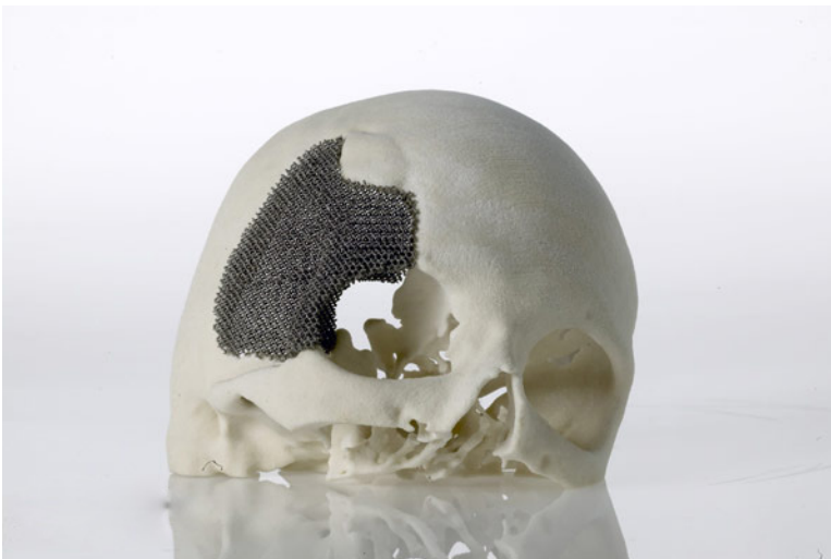
3-D printed model of a patient that required maxillofacial reconstruction. The implant was developed to fit perfectly before surgery began. The printed model aided in preoperative, surgical planning.

Even though the 3-D printed model may not change the way in which traditional surgery is conducted, it serves as an additional aid in the operating room and can improve surgical success. “Stereolithography has been shown to be a useful tool in maxillofacial surgery, reconstructive surgery, orthopedics and in pediatric cardiac operations.” Maxillofacial surgery is a corrective surgical procedure on the mouth and jaw portion of an individual including mouth and jaw disorders (AAOMS Information, 2010). “By using this technology, surgical templates or customized implants can be tested on the models, or anatomic structures can be reconstructed before the operation. These three-dimensional, life like models might also be helpful for preoperative planning of surgical procedures in a wide variety of clinical situations” (Sodian et al, 2008).