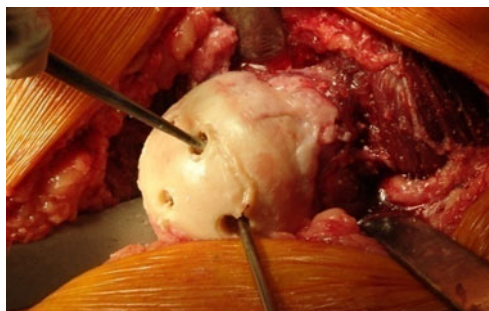
Fig. 1 Surgical technique of necrotic subchondral bone removing

performed simultaneously in one patient during the OATS procedure. The patients used two crutches with partial weightbearing for 12 weeks after surgery. Partial weightbearing with at least one crutch was advised for the following nine months.