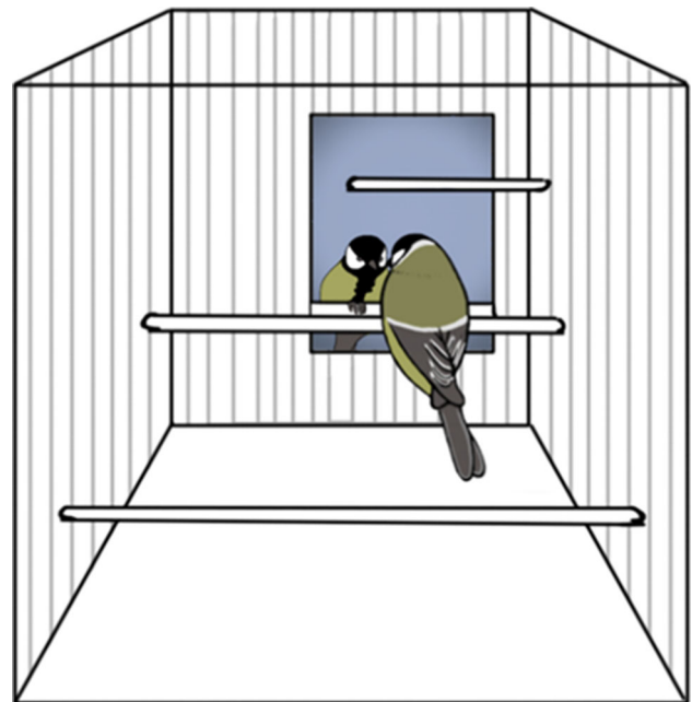
Fig. 1 Position of the mirror in a great tit's home cage. Observe that the drawing is not made to scale; the mirror was smaller than it appears in the figure (see text)

The study consisted of two phases: five training sessions and then a mark-test session. We recorded all training and test sessions in Lund with a Sony Action Cam HDR-AS200VT and in Prague with a Canon HG20 camera. The cameras were mounted approximately 20 cm from the cage's short end angled slightly downward so that they provided good views over the whole cages and their floors. Training sessions lasted 20 min in both Lund and Prague, and we started each such session by introducing a vertically positioned mirror in the focal bird's home cage (Fig. 1). The mirrors we used were 15–18 cm high and 10–16 cm wide and mounted against a wall of the cage. As it was hard to determine precisely where a bird was looking or sometimes even its specific behaviour, we analysed the bird's behaviour afterwards by watching the recordings. The playback was repeated or slowed down if the behaviour of a bird was difficult to categorize. We categorized the bird's behaviour in accordance with a similar study on birds (Prior et al. 2008) (Table 1). Between the sessions, we removed the mirror from the cage to minimize the risk of uncontrolled effects. In accordance with Prior et al. (2008) and Soler et al. (2014), we started to analyse both the frequencies of the various behaviours and the times spent on them. Early in this process, we realized that the