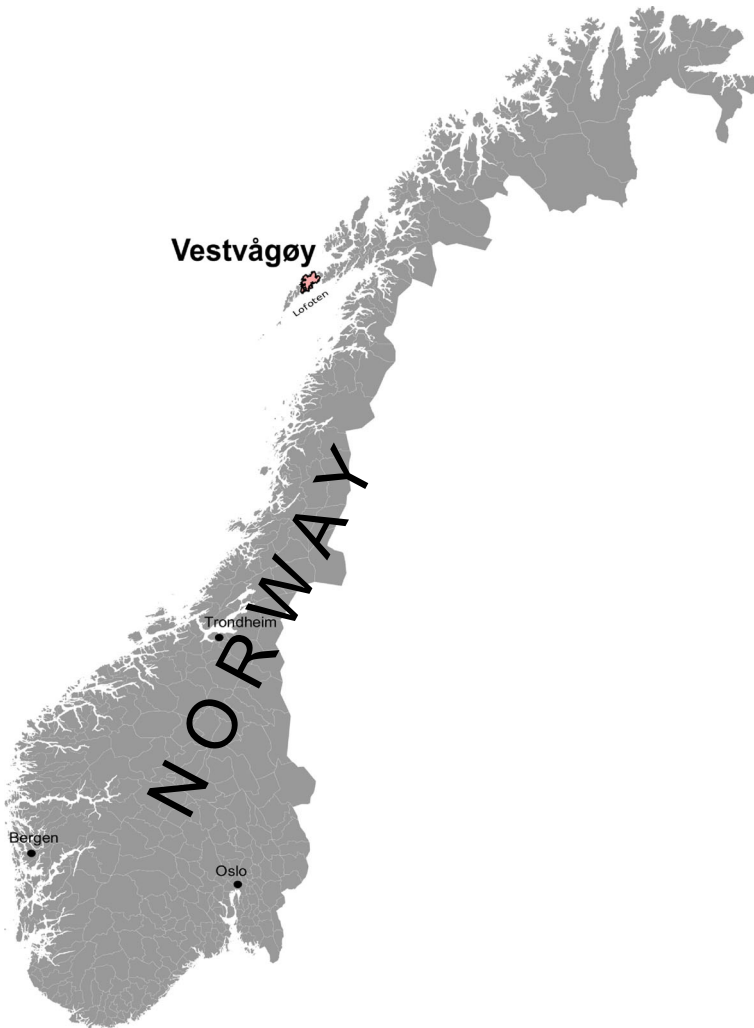
Fig. 2 The case study site, Vestvågøy municipality, Nordland County, Norway

climate projections and local observations of weather changes we would expect the inhabitants to worry about the impacts of climate change (Kvalvik et al. 2011; Hovelsrud et al. 2010).